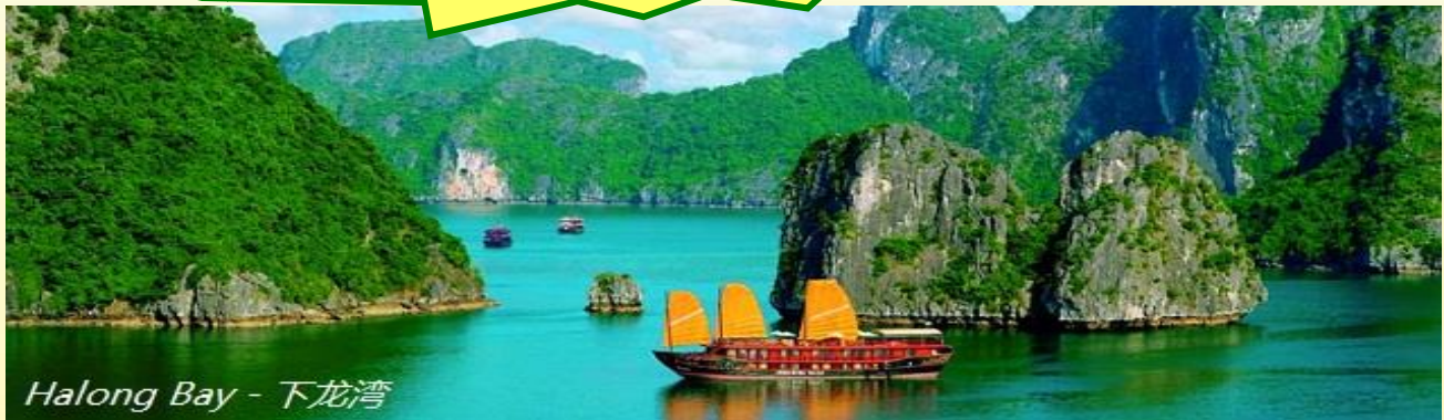
Halong Bay - 下龙湾