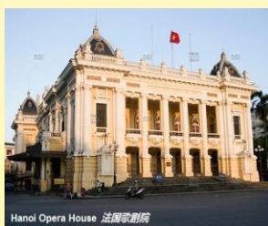
Hanoi Opera House 法国歌剧院