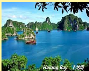
Halong Bay - 下龙湾